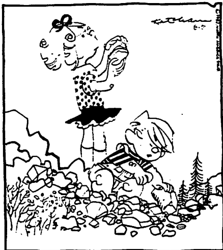
"Naw, I don't collect rocks ... I collect what's under 'em."